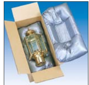
Instapak® Foam-in-place packaging