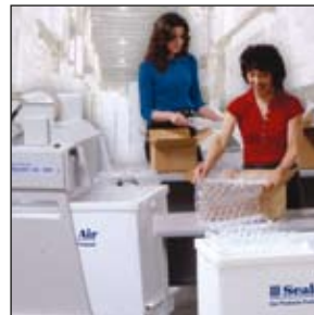
NewAir I.B.™ 200 Packaging System