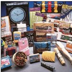
Cryovac® Performance Shrink films