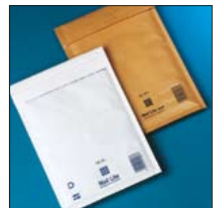
Mail Lite® Protective postal bags