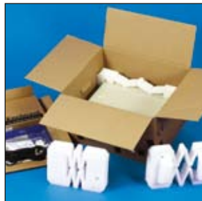
Stratocell® High performance cushioning