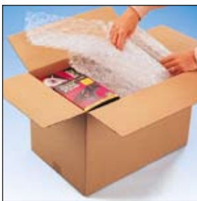
AirCap® Barrier-sealed bubbles

Sealed Air's industry-leading investment in research and development and constant focus on World Class Manufacturing principles allow us to continue to deliver innovative packaging solutions that add measurable value to our customers' business around the world.