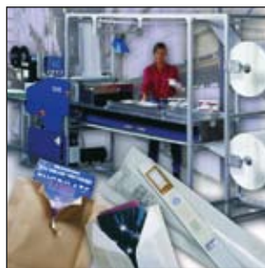
PriorityPak™ Automated Packaging System