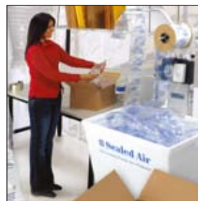
Fill-Air® On-site air cushioning system