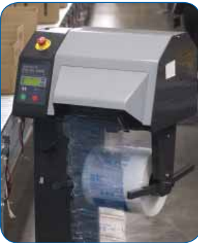
Create various cushion sizes with the Fill-Air® 2000 system.

The Fill-Air® 2000 system creates cushions in six different sizes, with the ability to change between 100mm and 200mm at the touch of a button. Our landscape sizes, such as the 300mm x 100mm cushion, fill small voids more efficiently.