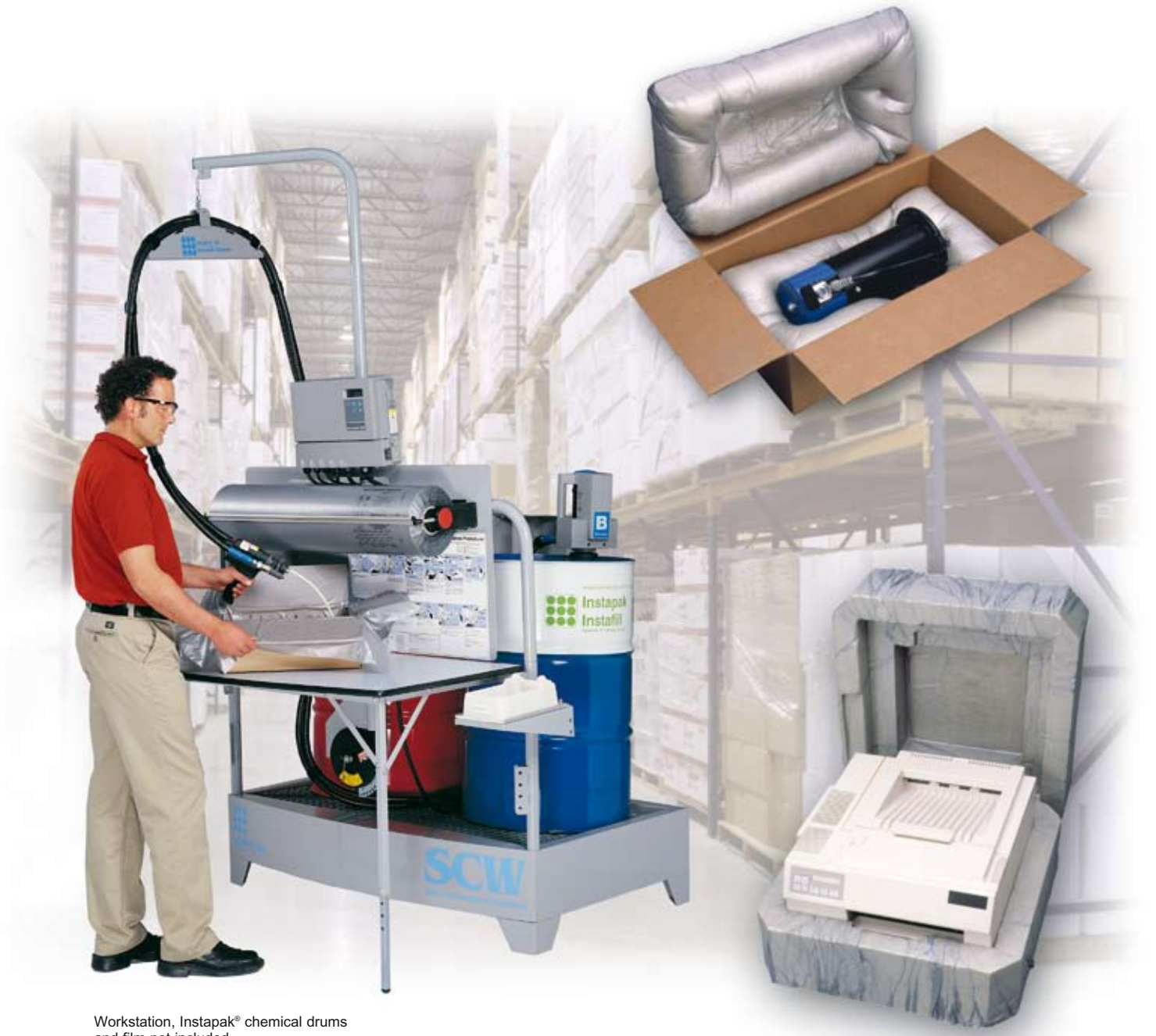
Workstation, Instapak® chemical drums and film not included.