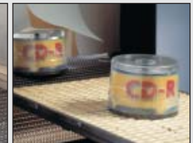
... shrinks tightly, ready for distribution.