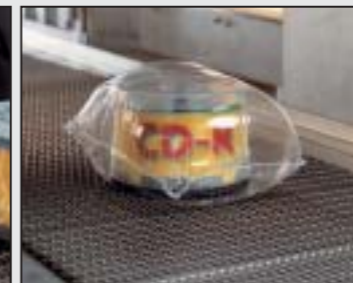
Package enters heat tunnel where film expands, then ...