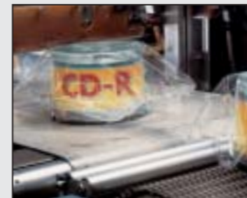
Product is wrapped with film and sealed.